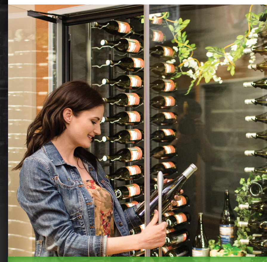
The No-Barriers View

The Anthony® Vista® B delivers an unobstructed view that creates the feeling of having no barrier between the customer and merchandise. The thin profile, all-glass doors offer durability and feature the exclusive Vista Arch handle to minimize any perceived barrier and to enhance clear product visibility.