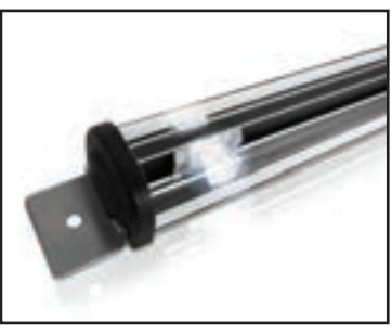
Optimax Pro 24 LED