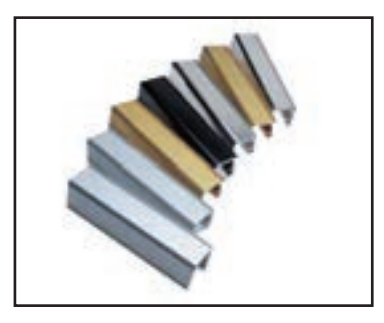
Door Rail Finishes

Anthony's glass display outside mount doors are the most energy-efficient doors in the industry for merchandising medium- and low-temperature products. Available with patented heat-reflective glass coatings, the outside mount doors provide energy efficiency and maximum product visibility. These doors can be manufactured to fit your newly-engineered or existing refrigerated display areas, and are suitable for a variety of applications.